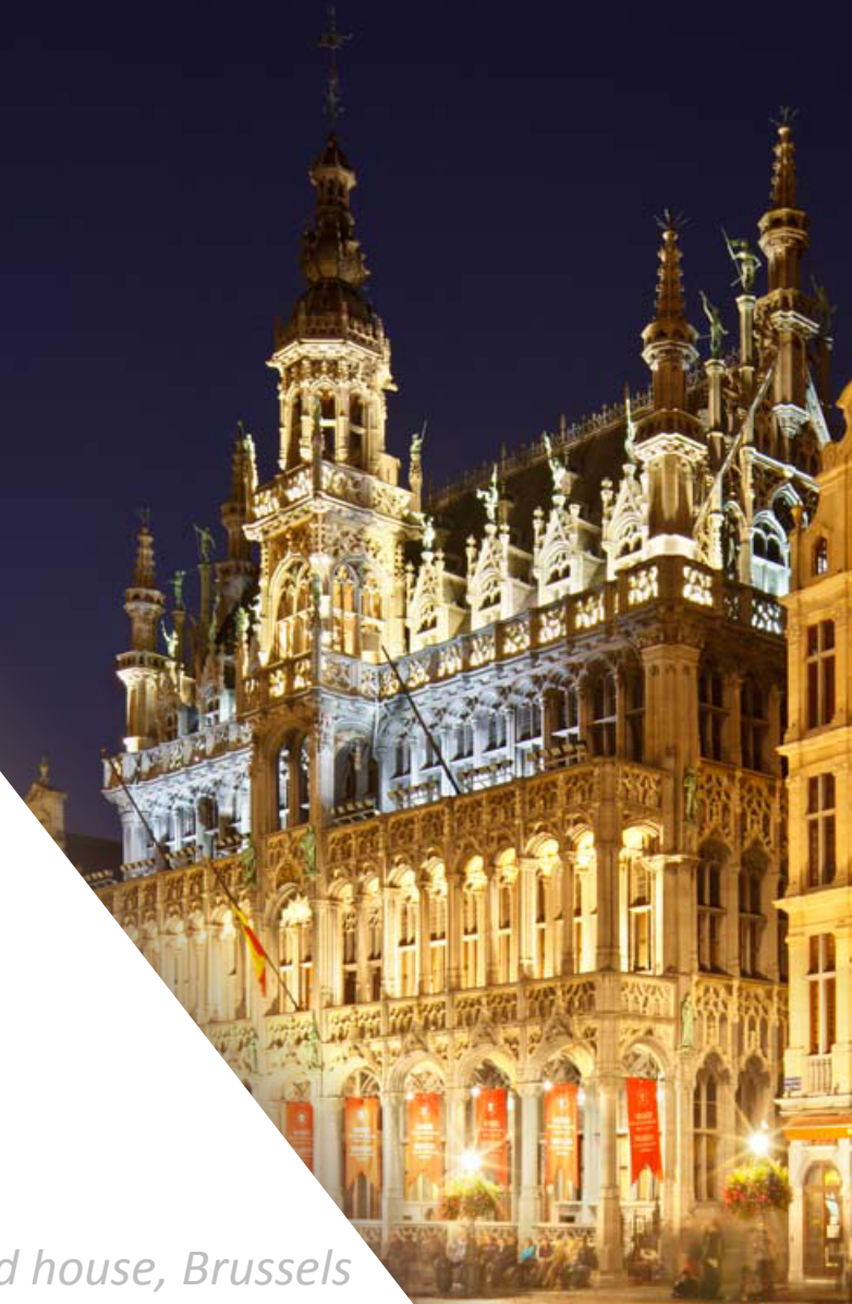
Bread house, Brussels